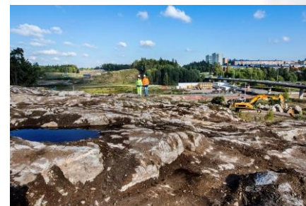
Project Hjulsta Södra